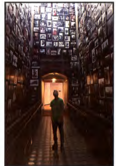
In awe over an exhibit while touring the Holocaust