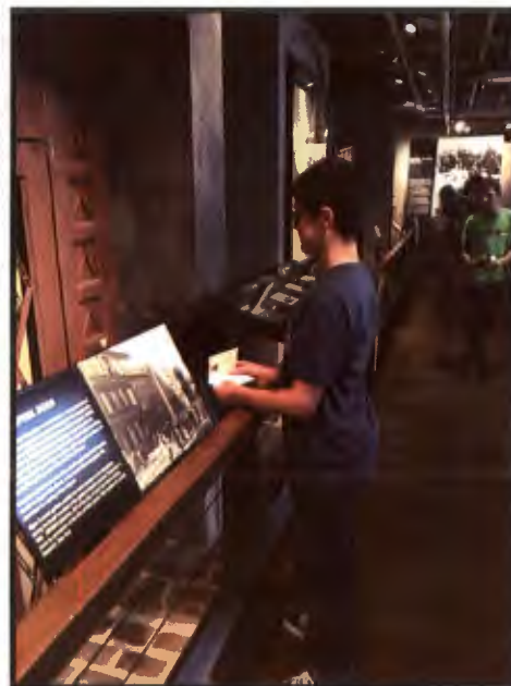
Above: Learning more about an exhibit featured in the Holocaust Museum