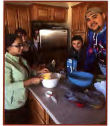
Students enjoying baking cookies and snacks to share with our community. Their hard work was nicely rewarded with so many notes of thanks and appreciation for their kind gesture.

Before our students went home for the Holidays we thought it would be a lovely gesture to bake a variety of treats that would be hand delivered to Chamberlain's neighbors.