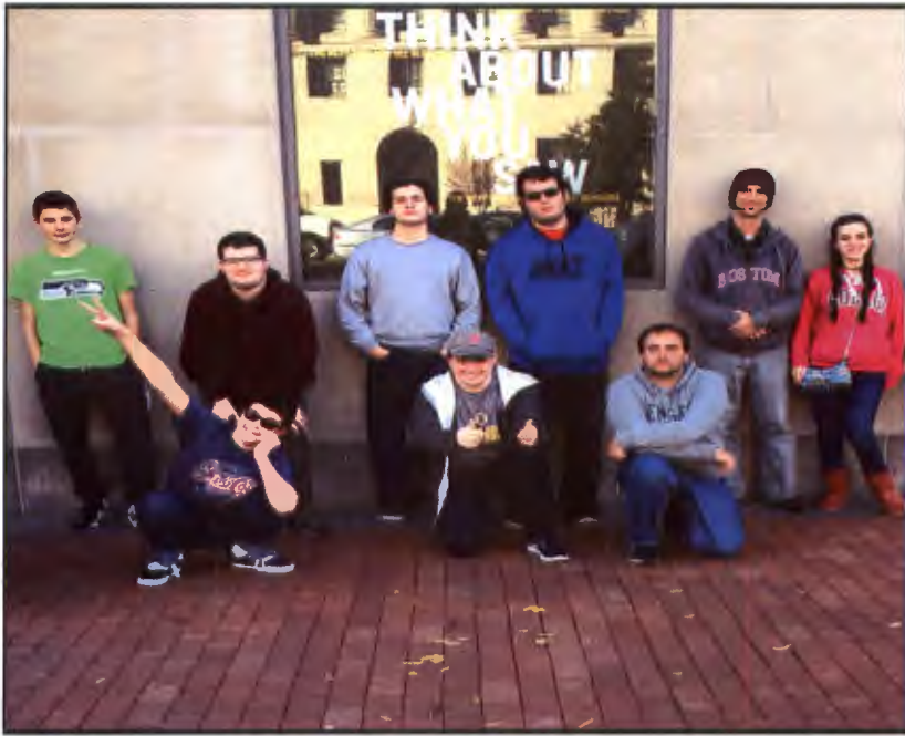
Paying respect at the Holocaust Museum

While in DC, the students and staff visited various sites and attractions. Among the list of places visited were the Holocaust Museum, the Library of Congress, the United States Capitol, the Tomb of the Unknown Soldier, Arlington Cemetery, the Museum of Natural History, the National Air and Space Museum, the National Museum of African American History and Culture, and last but not least and NFL game at FedEx field! The kids were excited, interested, and engaged during the tours and paid their respects in many ways. We had a great group and a great time!