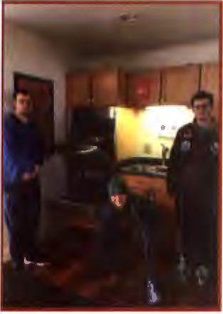
Students learning important nutritional information while gaining in their baking skills