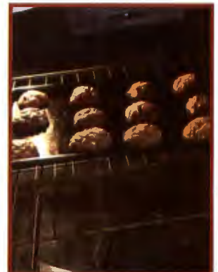
Chocolate Peanut Butter Chunk Cookies from scratch!