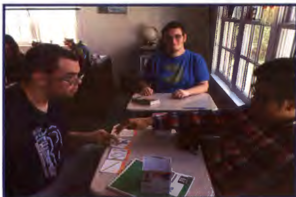
A group of students work together teaching a new International student from China English!